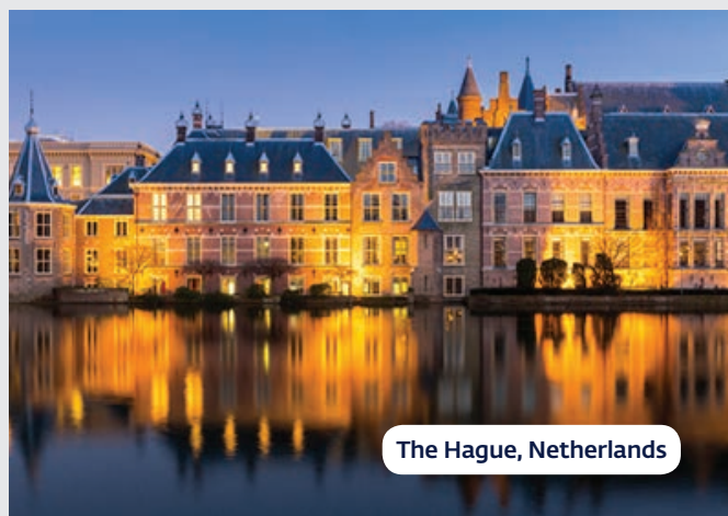
The Hague, Netherlands